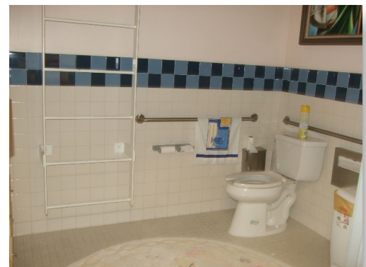
A.D.A. Men/Ladies Restrooms